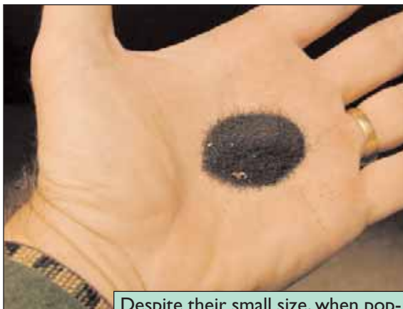
Despite their small size, when populations are abundant springtails can be collected by the handful.

Springtails can be distinguished easily from fleas, which are black or brown, teardrop-shaped and flattened on their sides. Adult fleas actively jump onto people and pets and bite them; springtails do not bite.