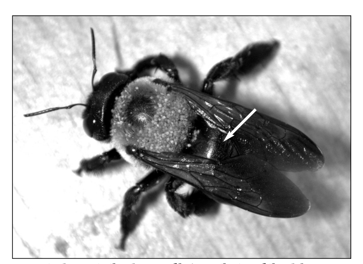
Carpenter bee: Note the absence of hairs on the top of the abdomen.

Xylocopa carpenter bees closely resemble bumblebees in size and color. The bodies of both types of bees are mostly covered with yellow,