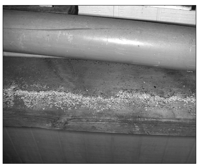
Sawdust accumulation below carpenter bee entry hole.

Carpenter bees usually make their entry holes in well-lighted areas with overhead protection. However, if the entry hole is in the open, it will be on the side away from prevailing winds.