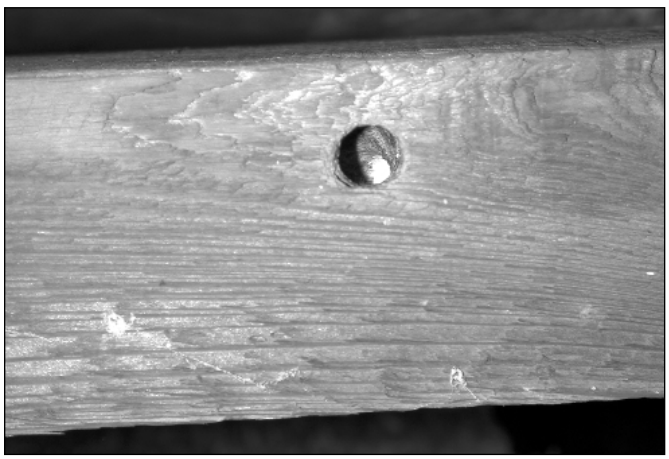
Carpenter bee gallery entrance hole.

After a gallery has been prepared, the female prepares a special "bee-bread" to feed her off-spring. To make it, she mixes collected pollen with regurgitated nectar and places it at the end of the tunnel. The female then lays her egg—one of the largest in the insect world—on this food.