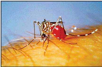
Aedes aegypti or the yellow fever mosquito

The two most common backyard biters in south Texas are also included in the flood water group of mosquitoes and play a significant role in disease transmission. Aedes aegypti (yellow fever mosquito) and Aedes albopictus (Asian tiger mosquito) are black and white in coloration, oviposit (lay) their eggs in artificial containers (cans, children's toys, tires, potted plants, or any object that holds water for over 7 days), and prefer to