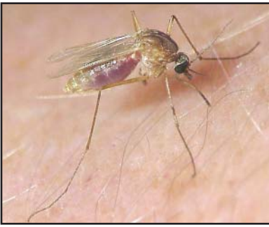
Culex quinquefasciatus or the southern house mosquito

The most important standing water mosquito species is the southern house mosquito ( Culex quinquefasciatus ), the primary vector of West Nile virus and St. Louis encephalitis in Texas. This mosquito species breeds in septic water found in roadside ditches, storm sewers, birdbaths, or any container or depression that holds water for more than seven days.