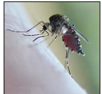
Aedes taeniorhynchus or the black salt marsh mosquito

The aftermath of hurricane Dolly has set up south Texas as a potential hot bed for mosquito production and the diseases they transmit. The mosquito problem is divided up into two distinct waves of activity that occur after a flooding event. The initial influx or first wave of mosquitoes belong to a group known as flood water mosquitoes which include the salt marsh ( Aedes taeniorhynchus , Aedes sollicitans ) and pastureland mosquitoes ( Psorophora columbiae , Psorophora cyanoescens , Aedes vexans ). These mosquito species deposit their eggs on soil and in depressions that are subject to periodic flooding. When flooded, the eggs hatch simultaneously resulting in large swarms of mosquitoes five to seven days after the flooding event during the warmest times of the year. These mosquitoes are primarily annoyance species that play minor roles in disease transmission.