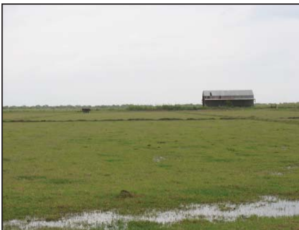
Flooded pastureland is a typical oviposition and larval habitat of flood water mosquito species.

Further information on this disease and fact sheets on mosquito biology and ecology can be found on the Agricultural and Environmental Safety website ( www-aes.tamu.edu ) or from m-johnsen@tamu.edu .