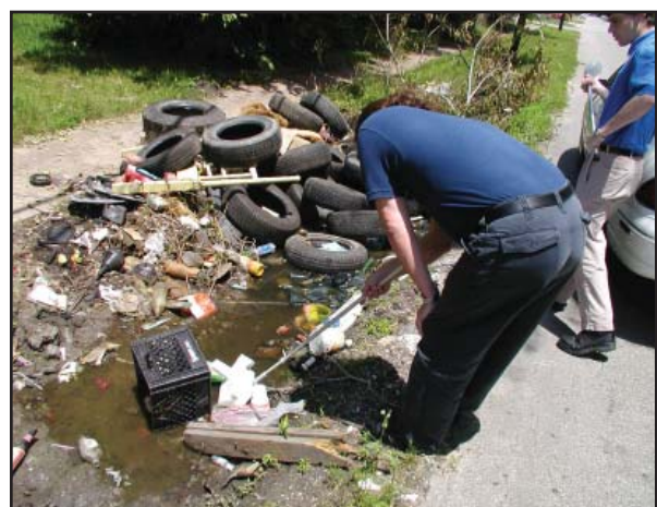
Mosquito control personnel checking a typical Culex quinquefasciatus larval habitat.