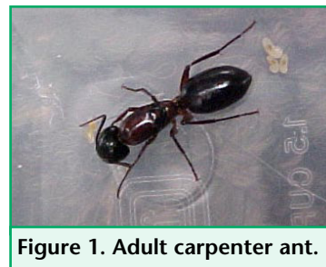
Figure 1. Adult carpenter ant.

The ants develop through several stages of metamorphosis: egg, larva, pupa and adult. All four stages can be found in a colony. The adults have six legs, three distinct body regions with a constricted waist, and prominent, elbowed antennae. They can be solid