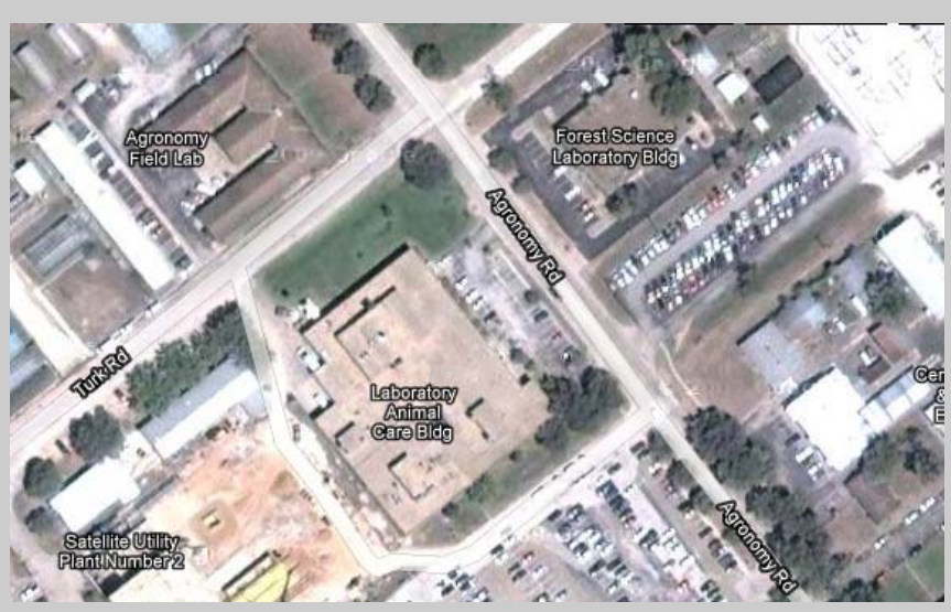
This page was last updated on January 7,2010